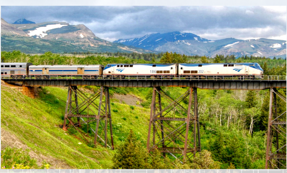
Amtrak Empire Builder @ Two Medicine Trestle, Montana

service change proposals in its FY2021 supplemental request, our Association has been clear that while we strongly support emergency funds for Amtrak, any additional funds need to buy certainty for workers and passengers alike and daily train service must be the very minimum service level.