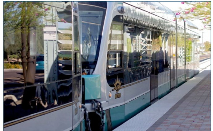
Phoenix Light Rail

City leaders launched a campaign to explain to voters that the streetcar system has generated billions in economic activity and is an important part of creating a vibrant, livable community in central Phoenix.