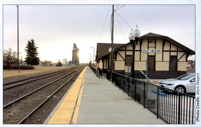
Cut Bank, MT

The community raised money to restore the exterior of the Cut Bank station in 2010, and Amtrak installed a lengthy ADA-compliant platform and new lighting in 2011. In 2017, Amtrak upgraded the waiting area with ADA-compliant bathrooms. Cut Bank is the Northernmost stop in Amtrak's Long-Distance network, and the Northernmost point in North America served by a daily passenger train featuring traditional dining and sleeping car service.