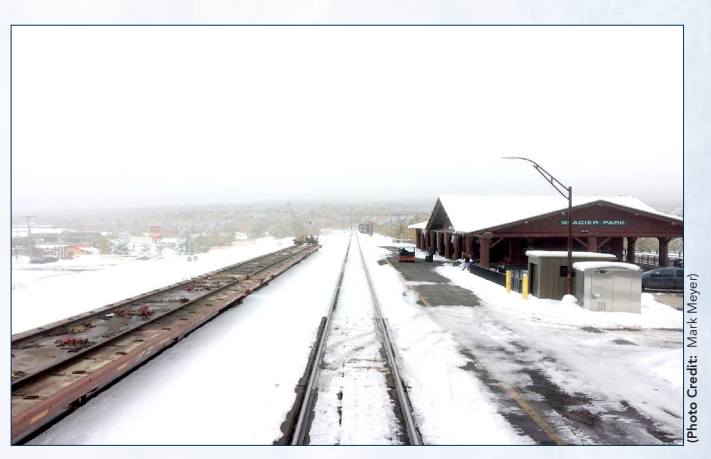
East Glacier Park, MT

Glacier Park station (known locally as East Glacier Park) has always been the primary railroad gateway to the park, astride the iconic Glacier Park Lodge (in continuous service since 1913). Amtrak began operating the Empire Builder through Glacier Park station in 1971. In 1973, Amtrak discontinued