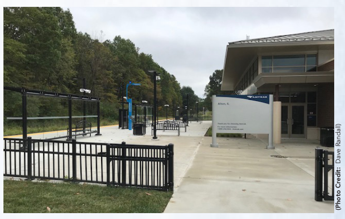
The Amtrak station in Alton, IL

The opening of the Alton station has been a source of importance to the community, but even with all the amenities, there was a problem. The station was only open, 5:00 am - 4:30 pm or the departure of Train