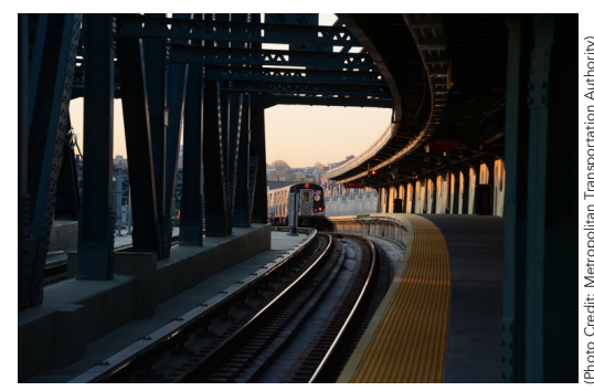
A New York City subway.

questions about the project's progress, financing and delays, and environmental reviews on different segments of the HSR line.