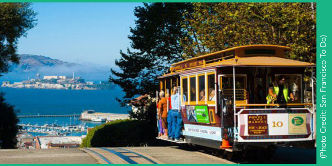
San Francisco cable car.

carrying people for transportation. The cables that the cars run on move at a speed of 9.5 MPH.