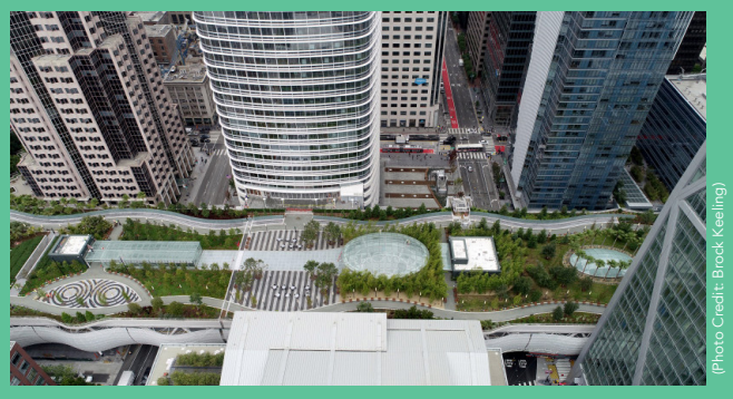
Aerial view of the Salesforce Transbay Transit Center

Rail Extension will add an underground terminal station for Caltrain and California High-Speed Rail service and is expected to open in 2028.