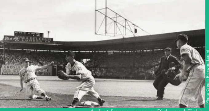
A shot from a game at Rickwood Field.

city limits, Barber Motorsports Park is the world's largest motorcycle museum.