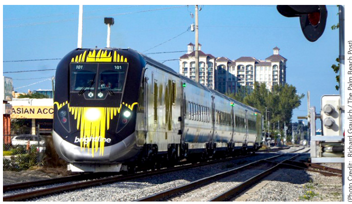
Brightline will begin offering 16 daily round trips in August.

THE SOUTHEASTERN PENNSYLVANIA TRANSPORTATION AUTHORITY (SEPTA) performed