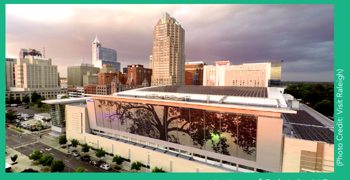
A view of Raleigh, NC

number of oak trees in and out of the city limits. Many of the oak trees line the city's streets.