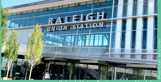
Raleigh Union Station opened in July.

restaurant with a rooftop patio on the third floor.