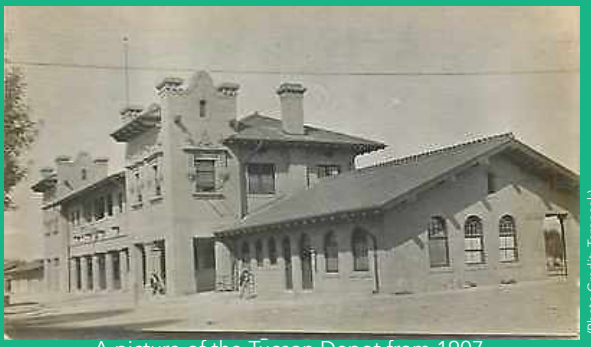
A picture of the Tucson Depot from 1907.

convention center. One-way passes are $1.50, or a one-day pass is $4.00. More information can be found at www. sunlinkstreetcar.com.