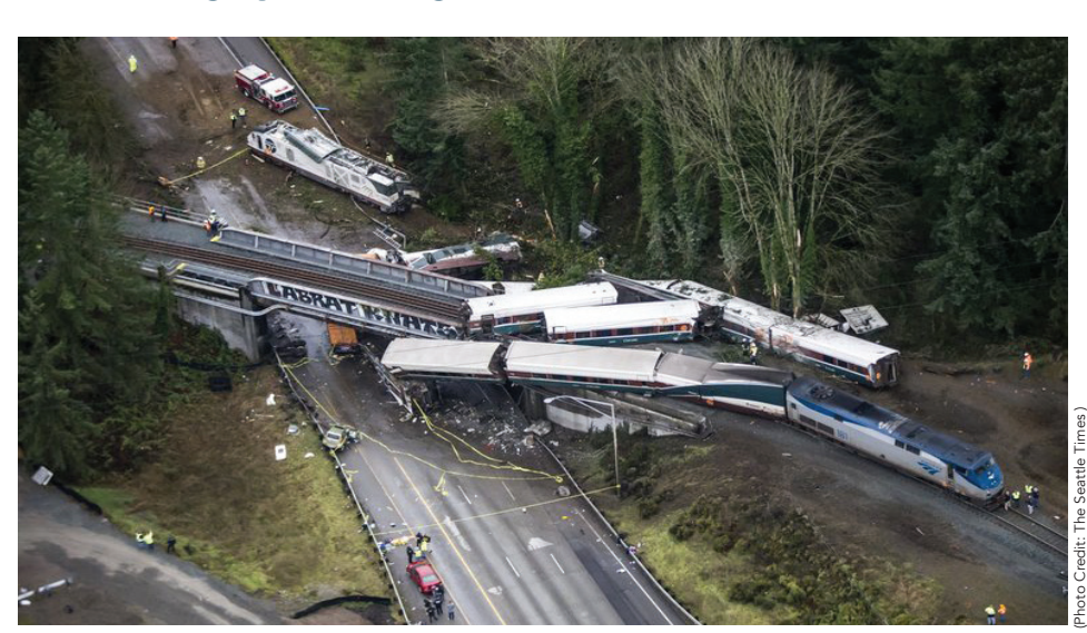
Amtrak Cascades Train 501 derailed on December 18, 2017.

The National Transportation Safety Board dispatched