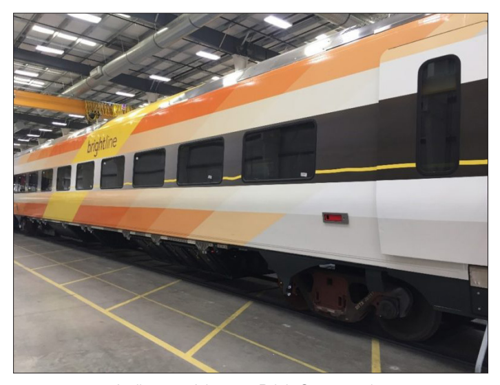
A glimpse of the new BrightOrange train. (Photo Credit: Brightline).

All Aboard Florida Brightline - Brightline is poised to welcome two additional new trainsets, BrightGreen and BrightOrange, highlighting increased support from Florida's state legislature. The benefits would greatly aid the state of Florida, which could lead to the creation of 10,000 direct construction jobs, and generate over $650 million in federal, state, and local tax revenue. The line also has the ability to take three million automobiles off the crowded Interstate 95 corridor. Additionally, the city council of Orlando approved a resolution that called on state lawmakers to reject bills HB 269 and SB 386, which would hinder the development of the project. The decisive factor in the council's decision was the project's potential to create jobs and spur economic