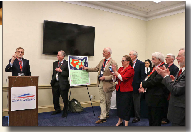
NARP members participate in Congressional Reception.

I can't say enough about how your D.C. staff worked so hard putting together the Summit and Hill visit. I know that the rest