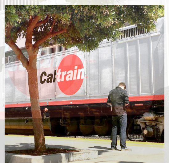
Caltrain passing by a pedestrian.

bond money. In addition, the project is estimated to create more than 9,600 total direct and indirect jobs. The program has been the driving force for the construction of a new railcar assembly plant in Salt Lake City, UT, which will generate sustainable, family-wage jobs for 550 employees.