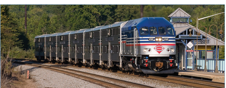
Virginia Railway Express

Relieving the country's congested highways and developing new connections in rail transit are top priorities for officials in Virginia. Known as the "Atlantic Gateway," Governor Terry McAuiliffe has touted the initiative as a package of transportation projects that would relieve traffic congestion on Virginia's I-95 corridor, but it would also help push forward the groundwork for high-speed rail in the Southeast region. Overall, the entire "Atlantic Gateway" initiative would cost approximately $1.4 billion, and Virginia was awarded a $165