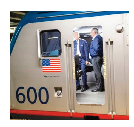
VP "Amtrak" Joe Biden tours Amtrak's new Cities Sprinters. http://blog.amtrak.com/2013/05/new-amtrak-locomotives-the-facts/

replacement, station upgrades, and maintenance facilities.