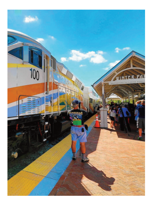
The ribbon-cutting ceremony for the new SunRail Station on Monday, March 3, 2014

More good news followed the ribbon-cutting ceremony; SunRail found out that President Obama had included $63 million in his proposed 2015 budget for its extension south of its current route into Osceola County.