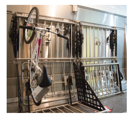
Above: Amtrak's new Viewliner II cars in production. Below: Bicycle racks on the inside of the new baggage cars will allow walk-on service on more trains.

The new baggage cars are being made by CAF USA in Elmira, NY. Amtrak is further modernizing its fleet with an order for 130 single-level, long-distance Viewliner