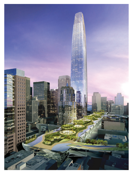
The center's first phase will include a five-story bus terminal stretching across four blocks and a rooftop park comparable to New york's High Line.

The project started in 2010 with the demolition of the former transit center, the Transbay Terminal. After massive excavation and underground work, the Authority reports that it will begin to make progress on the above-ground structure this fall. The later stages of construction will yield a 5.4 acre public park on the roof and new neighborhoods, parks, shops and offices surrounding the new center.