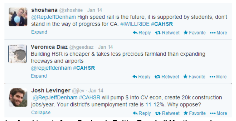
A sample of real tweets from Denham's Twitter Townhall Meeting on January 14.

Follow @narprail on Twitter to be part of the movement for more trains!