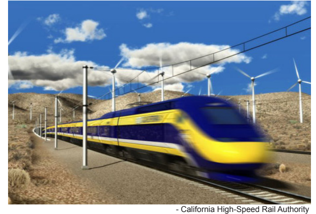
Rendering of a future Califoria high-speed train passing through a wind energy farm.

These trains also will be able to use the planned, new high-speed rail Fresno