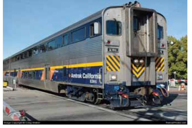
Coach/cab No. 8304, Mount Wilson, seen in Stockton, CA in March 2007, is one of the original California Car fleet upon which the new bi-level design standards are based.

the first to be issued by the Next Generation Corridor Equipment Pool Committee established under Sec. 305 of the 2008 Passenger Rail Investment & Improvement Act (PRIIA). The decision was made with input from host railroads, equipment manufacturers and passenger train operators other than Amtrak.