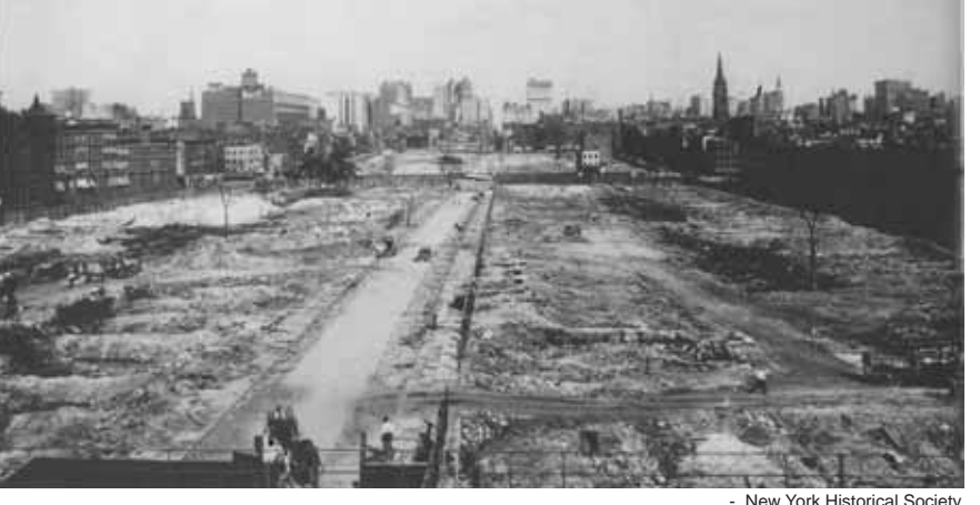
Site of New York's Penn Station in 1904. Although modern tunneling techniques would

The August NARP News should have said that the Senate Appropriations Committee's FY 2011 transporation/housing appropriations bill (S. 3644) has $250,000 for three new positions in addition to the 62 added positions (31 full time equivalents) the Administration requested.