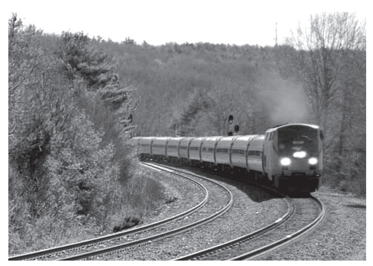
Record flooding in Rhode Island forced the closure of the Northeast Corridor between New Haven and Boston between April 1st and 4th (see photo on p. 3). Acela service over this segment was terminated. To serve Boston, Amtrak to its credit ran three Northeast Regional round-trips on the Inland Route (Worcester-Springfield-Hartford). Here, Regional 1163 heads west through Spencer, Mass., west of Worcester, on Apr. 4. Regular service resumed that evening.

board of directors unanimously approved the plan for daily service along the Los Angeles-New Orleans line which now runs tri-weekly. Amtrak is negotiating with Union Pacific, which owns the tracks. Service could begin as early as the Oc-