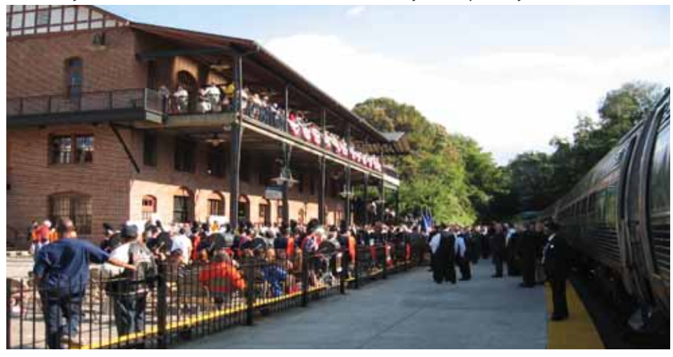
A large crowd, complete with marching band, at Lynchburg's Kemper Street Station during the ceremony after inaugural train's afternoon arrival on Sept. 30.

funds come from general funds, states should have the right to spend the money on railroad projects. Many legislators, however, favor limiting these funds just as if they were paid by motorists.