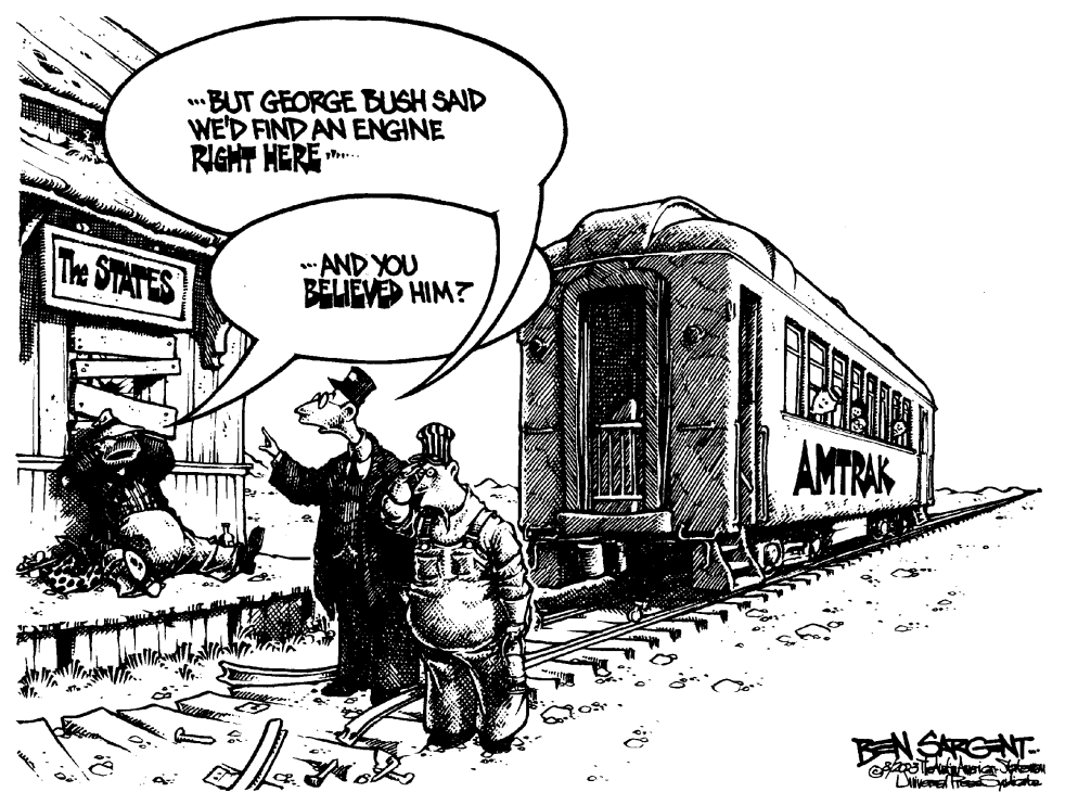
SARGENT © 2003 Austin American-Statesman. Reprinted with permission of UNIVERSAL PRESS SYNDICATE. All rights reserved.

"If we want a national passenger railroad system—and we do—there must be a dedicated source of funds to subsidize