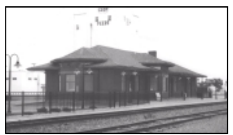
—John A. Mills

Construction to restore the station complex at Dodge City—the former El Vaquero ("The Cowboy") Harvey House—is nearing completion this fall. A photo from 2001 is at upper left. Built in 1898, "Destination Depot" will include space for Amtrak and for a community theater. Kansas DOT put in $5 million toward the $10 million project.